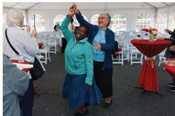
Marist Sisters dancing to the sounds of Elvis